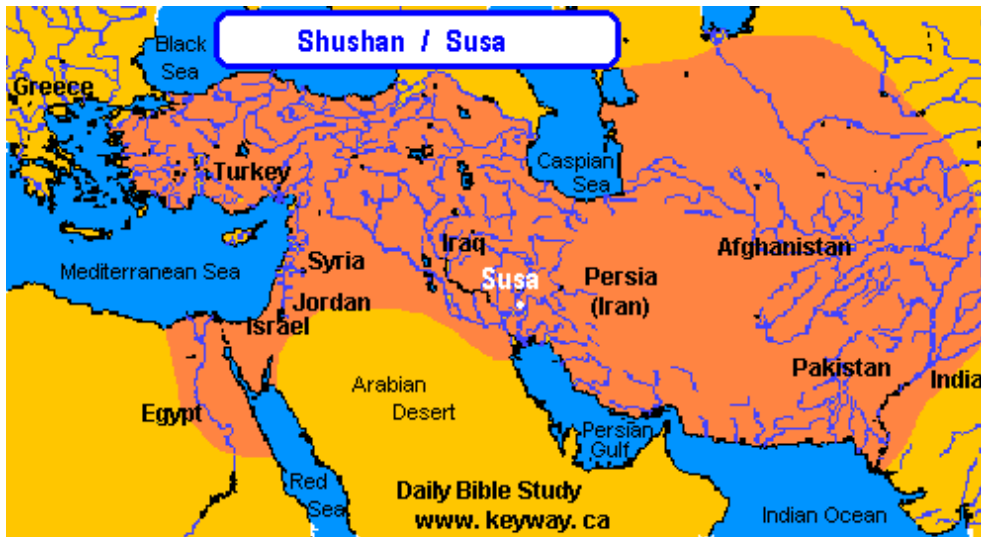
The Persian Empire

E _____, I _____, J _____, S _____, T _____, I _____, I _____, A _____, P _____, I _____